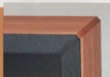
The L880 is finished either in matte black or in straight-grain walnut veneers with solid walnut corner bolsters.

ADS woven soft-dome mid-range and tweeter ADS' woven soft-dome driver technology results in unsurpassed accuracy in mid- and high-frequency performance. The L880's 19 mm/0.75 inch tweeter and 50 mm/2.0 inch midrange driver are constructed of a flexible woven material that is both low in mass for excellent transient response and rigid for low distortion. The tweeter and midrange domes are sealed with a proprietary damping compound that improves the already superb damping of the domes. The perfectly wound, single-layer voice coils move in extremely narrow magnetic gaps which maximize the field strength of the barium ferrite magnets. In addition, a high-gravity magnetic cooling fluid extends the tweeter's dynamic range and raises its maximum output capability.